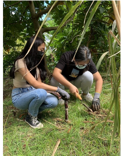
▲ Farrington Highschool students replant sugar cane at the Discovery Forest. 3/12/2022.