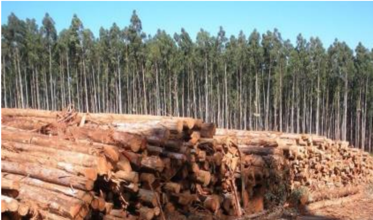
Eucalyptus along the Hāmākua Coast.