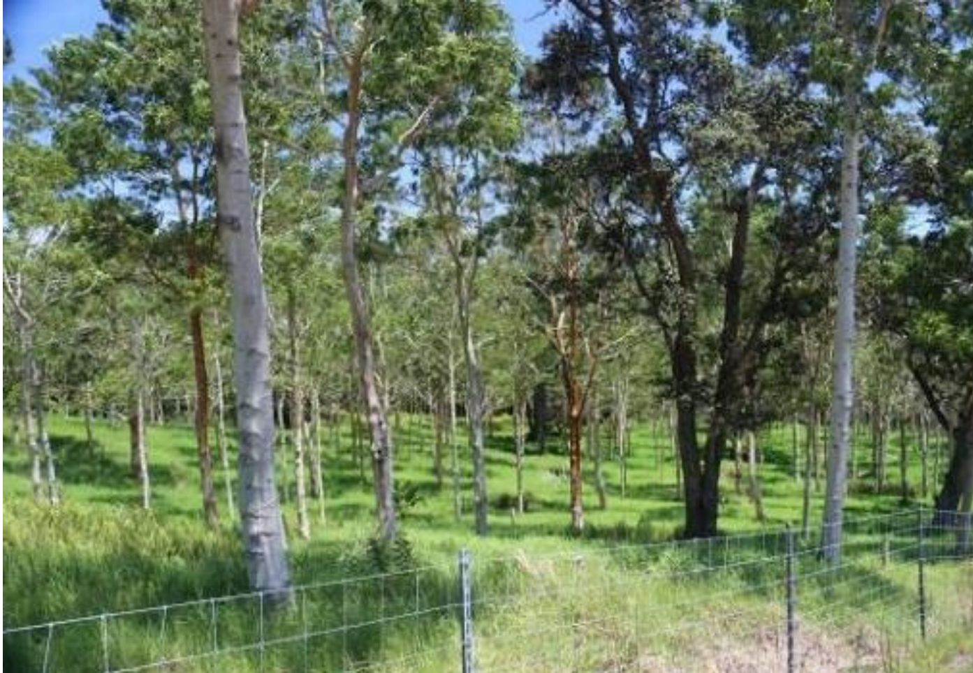
Koa seedlings at Native Nursery in Kula, Maui. 10 year old koa ( Acacia koa) planted under 'Ōhi'a ( Metrosideros polymorpha) windward Mauna Kea.