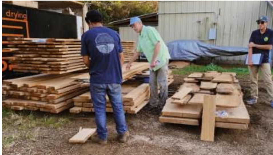
Hawai'i Wood Utilization Team (HWUT) wood drying short course at Kamuela Hardwoods.