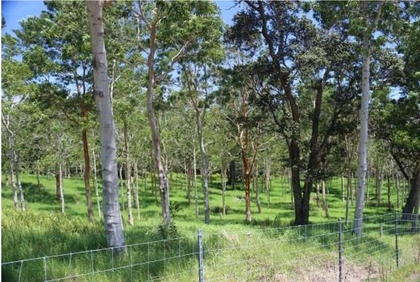
10 year old koa ( Acacia koa) planted under 'Ōhi'a ( Metrosideros polymorpha) windward Mauna Kea.