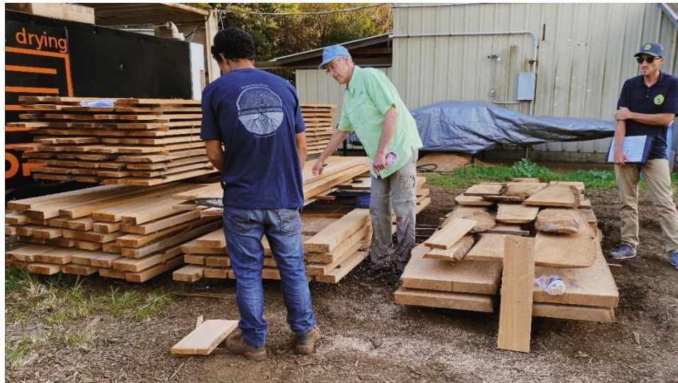
Hawai'i Wood Utilization Team (HWUT) wood drying short course at Kamuela Hardwoods.