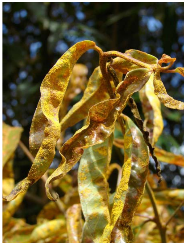
Syzygium jambos - Rose apple (Myrtaceae) Young leaves with Puccinia psidii damage at Hana Hwy, Maui, March 21, 2007.

There are numerous strains of the Puccinia psidii rust--some known to be established in Florida, and at least one reported from California. It is feared by some concerned scientists that strains may exist, or could mutate into existence, which could be devastating to ohia Metrosideros polymorpha , one of Hawai'i's dominant native trees. Ohia is a foundation species for many remaining Hawaiian native ecosystems. Source: www.hear.org/species/puccinia_psidii/ .