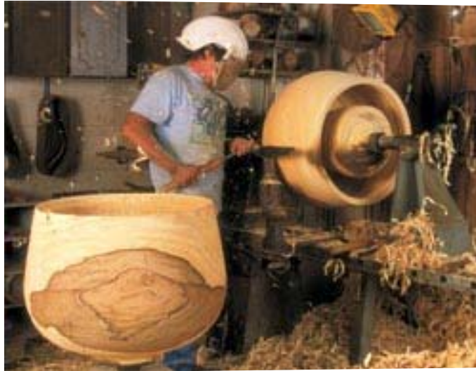
Our forests create jobs and a variety of forest products that help diversify Hawai'i's economy.

The 2004 survey suggests that Hawai'i's forest industry will expand in the next five to ten years. 3 The major driver for future growth in the short-term will primarily be fast-growing, non-native plantation tree species. 3 This began in the mid 1990s with the planting of tens of thousands of acres of eucalyptus plantations on Hawai'i Island and Kaua'i. 3 Kamehameha Schools is planning to begin commercial timber harvests of koa and of high value plantation species from their Hōnau forest in Kona. 3 This project has received sustain-