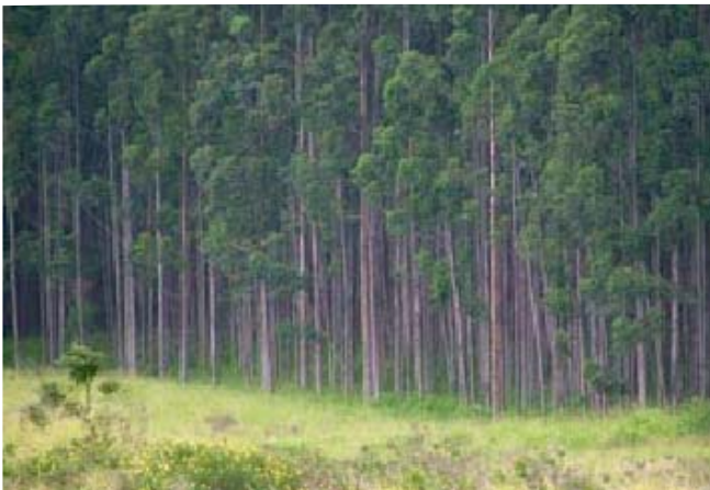
Eucalyptus stands along the Hämäkua Coast.

Tradewinds has committed to meet or exceed all local, state, and federal regulations affecting the environ-