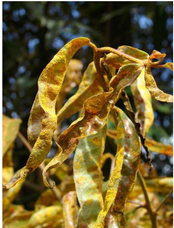
Syzygium jambos - Rose apple (Myrtaceae) Young leaves with Puccinia psidii damage at Hana Hwy, Maui, March 21, 2007.

There are numerous strains of the Puccinia psidii rust--some known to be established in Florida, and at least one reported from California. It is feared by some concerned scientists that strains may exist, or could mutate into existence, which could be devastating to ohia Metrosideros polymorpha , one of Hawai'i's dominant native trees. Ohia is a foundation species for many remaining Hawaiian native ecosystems. Source: www.hear.org/species/puccinia_psidii/ .