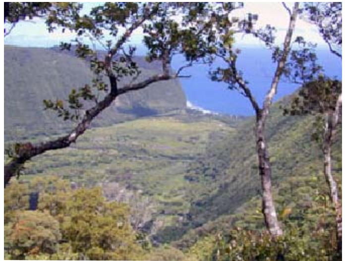
The Magnificent Waipio Valley: Encouraging green industries like Tradewinds veneer plant helps ensure that Hawai'i's environment is protected.

ment. They are dedicated to protecting the air, water, and soils of the community. They will be utilizing the existing well on the site, which is located downstream from O'okala's water supply. The veneer production process does not use chemicals, so everything going through the plant is clean, organic matter.