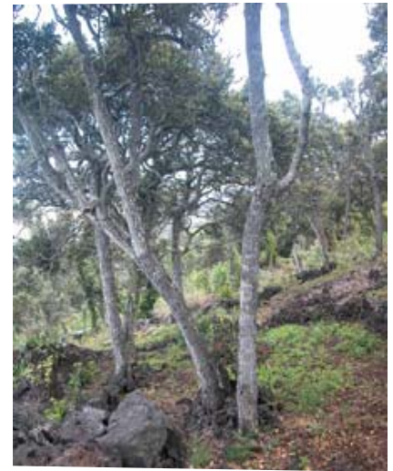
Ka`ūpūlehu Dryland Forest Trail Head.